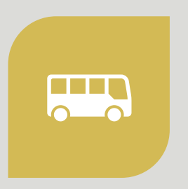
PROMOTE TRANSPORTATION INDUSTRY CAREERS