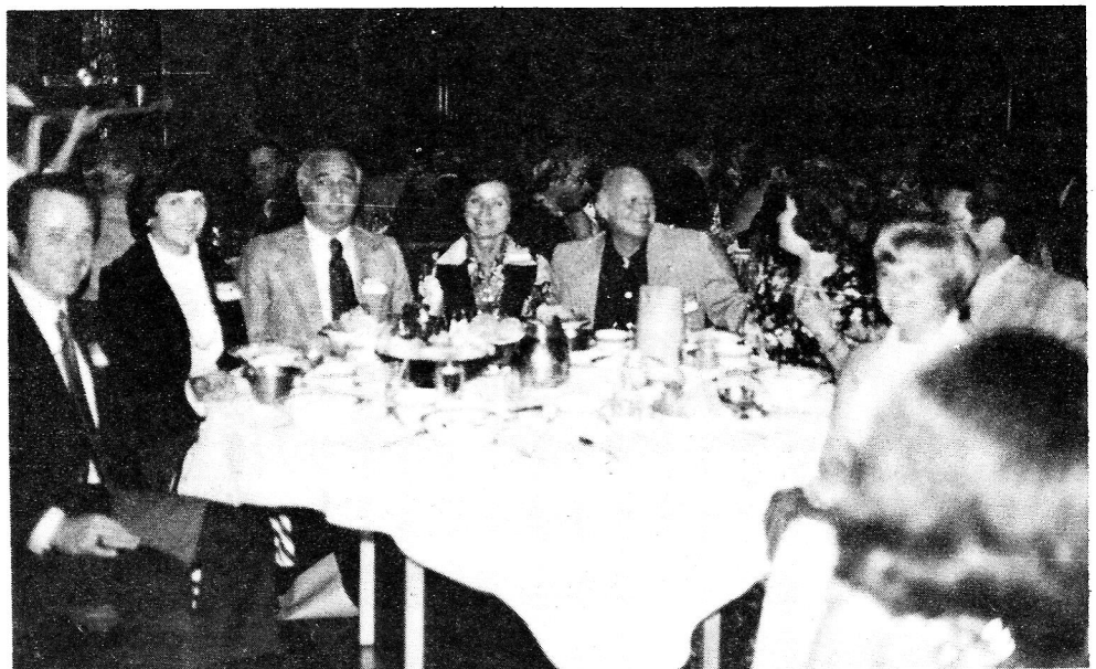
The Presidents Table at Pittsburgh Section's Past Presidents' Dinner, Holiday House, October 24, 1975.